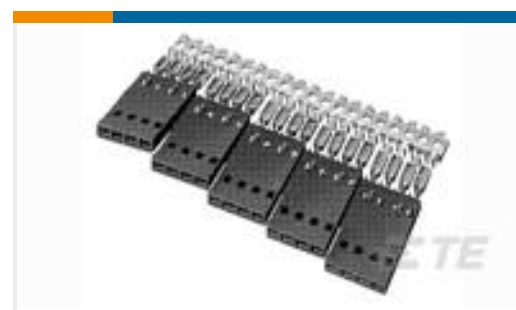
TE Part # 103969-1 10X2 MTE RCPT SR RIBBED .100CL