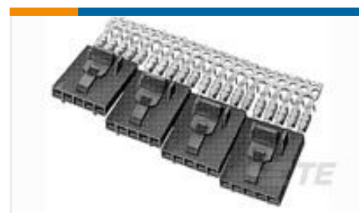
TE Part # 103957-1 10X2 MTE RCPT SR LATCH .100CL