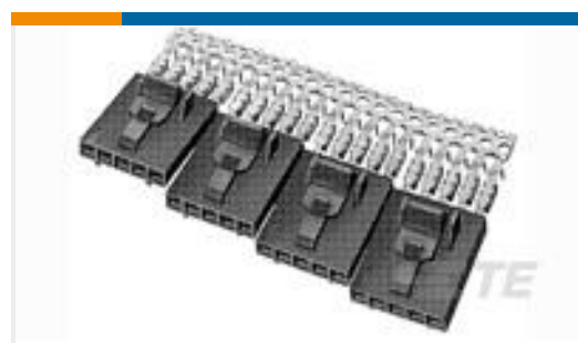
TE Part # 103960-1 10X2 MTE RCPT SR LATCH .100CL